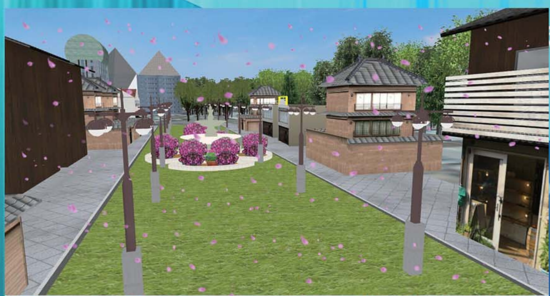
This area is designed in Japanese style for tourists. This area is not only very close to the two main stations, but also very close to the main stadium and other stadiums. In addition, tourists can enjoy the elegant environment, buy many souvenirs and learn some Japanese culture.