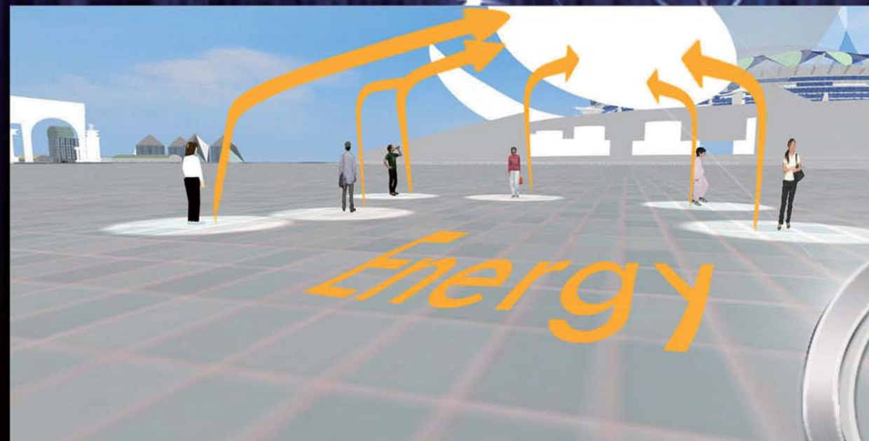
The island on the sea is a big energy collected machine. Many people walk on the ground. The pressure can be transformed into the energy. The outside five petals can restore energy which can offer the electrical energy to the main stadium. In this way, Everyone can make energy to support the Olympic.