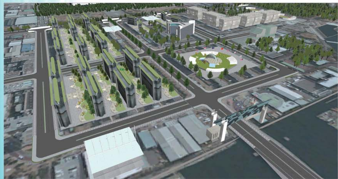
It's the general view of the Olympic town. The environment is very elegant and all the equipment is completed. Besides, the town can be used as residence after the Olympic.