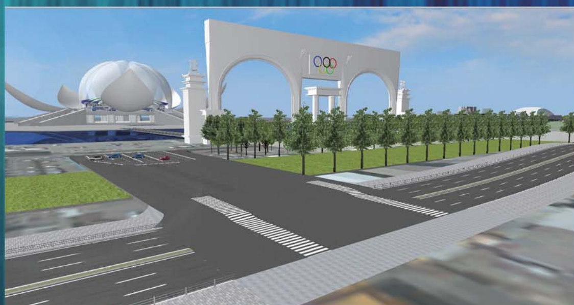
The gate to main island