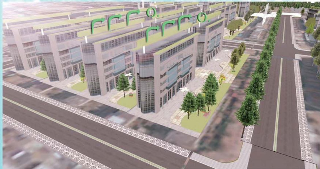
The apartments of the Olympic town have special roofs. The roofs are all planted to create O 2