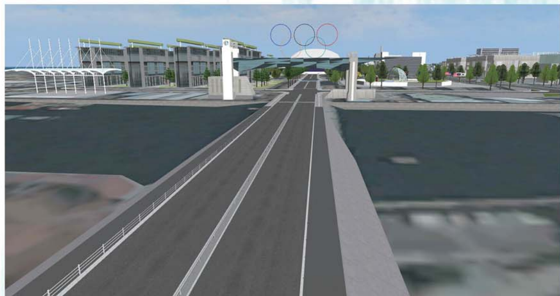
The Gate of the Olympic town