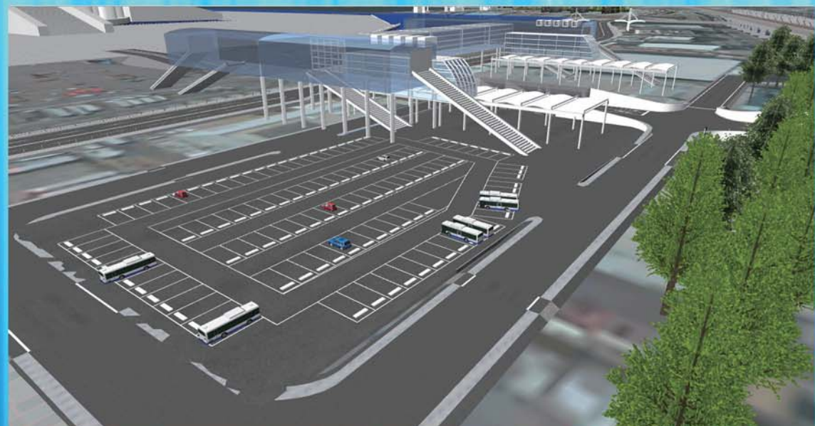
The Buses in the main station specially prepare for the athletes. And some of the bus are prepared for tourists.