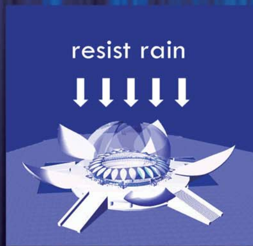
When it rains, the five petals inside can close to resist the rain and guarantee the match go on smoothly.