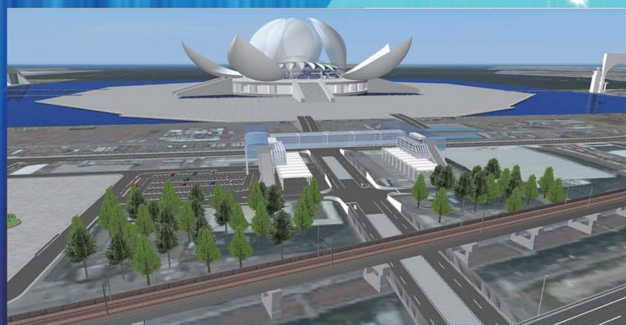
The petal as well as the other part of the main island can be dismantled and transported to other area. So, after the Olympic, our main island can be moved like a transformer.